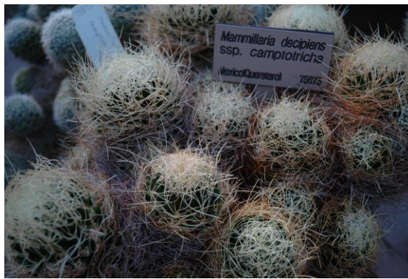
Mammillaria decipiens ssp. camptotricha