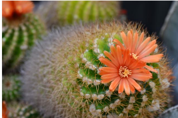
Parodia comaparana