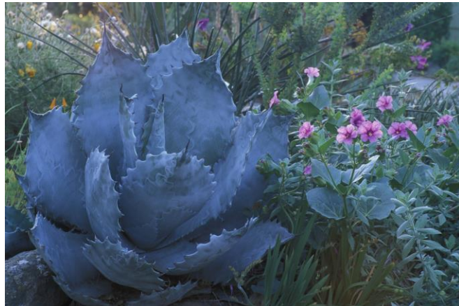
Agave colorata

** If your last name begins with F - K please bring in goodies for the refreshment table.