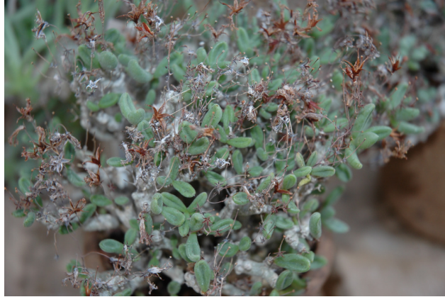
Tylecodon schaeferanus