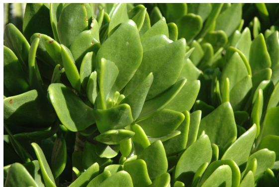
Tylecodon sp.