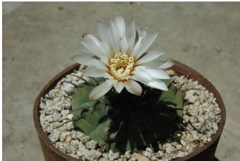
Gymnocalycium vatteri