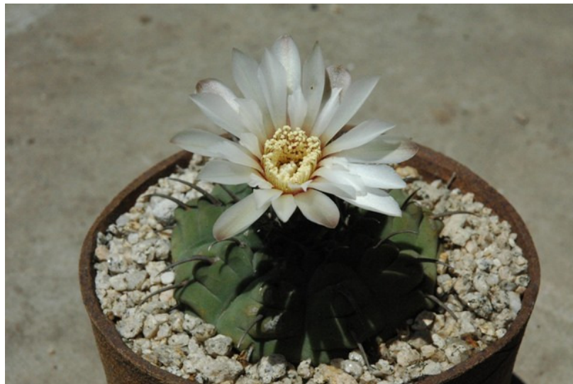
Gymnocalycium vatteri