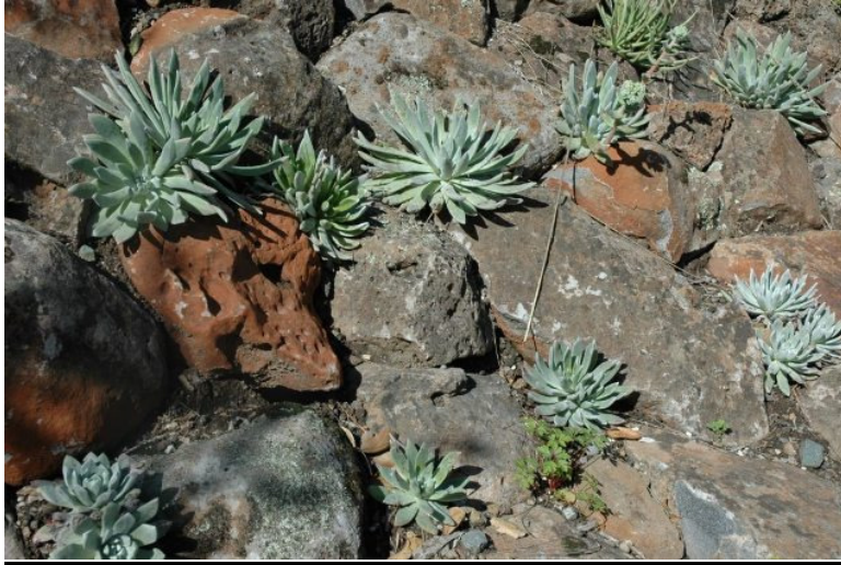
Dudleyas at UC Berkeley Botanical Garden, photo by N. Christianson

January 15, Desert Forum, Huntington Botanical Gardens, 1151 Oxford Road, San Marino, for info call 626-405-2160. (free admittance to the grounds this day when you are a Sunset member)